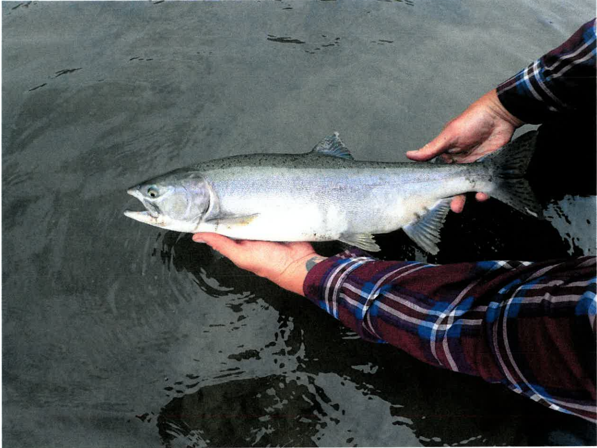
Female pink salmon