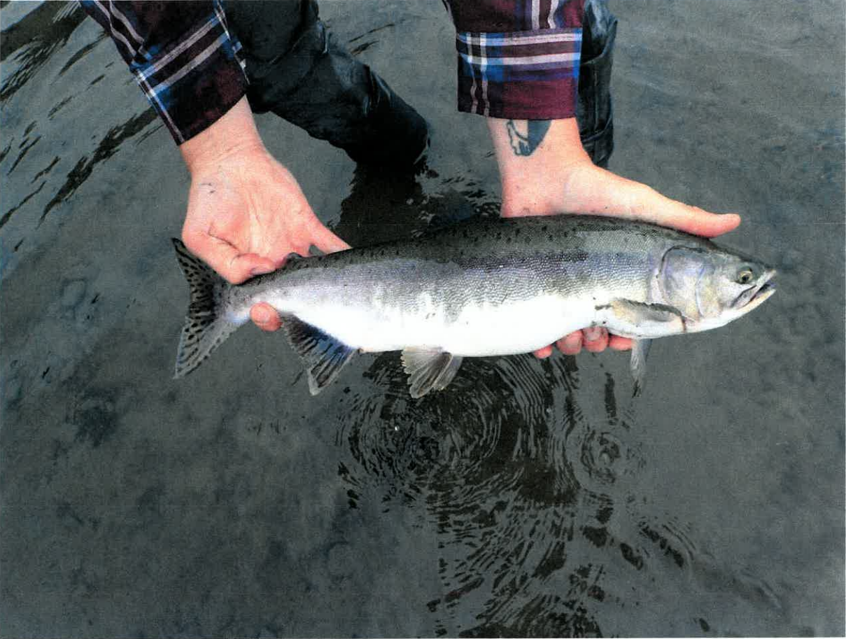
Female pink salmon.