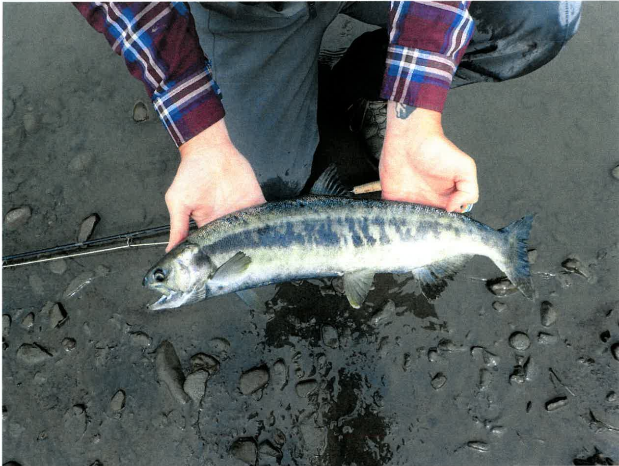
Female chum salmon.