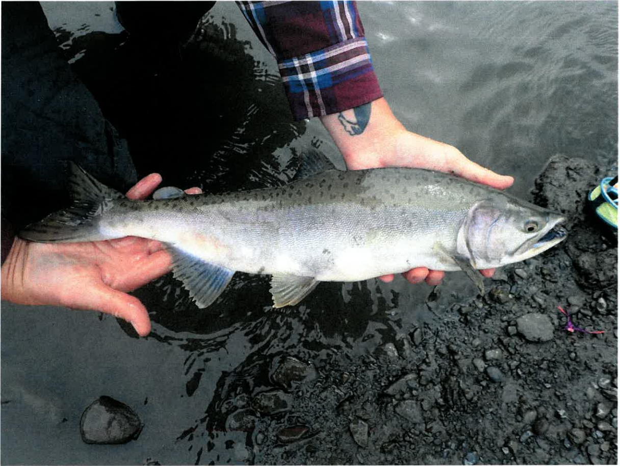
Female pink salmon