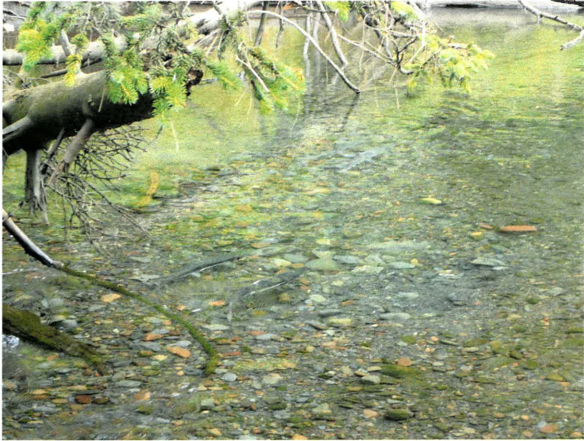
Pink salmon spawning in the foreground, chum salmon spawning upstream of them.