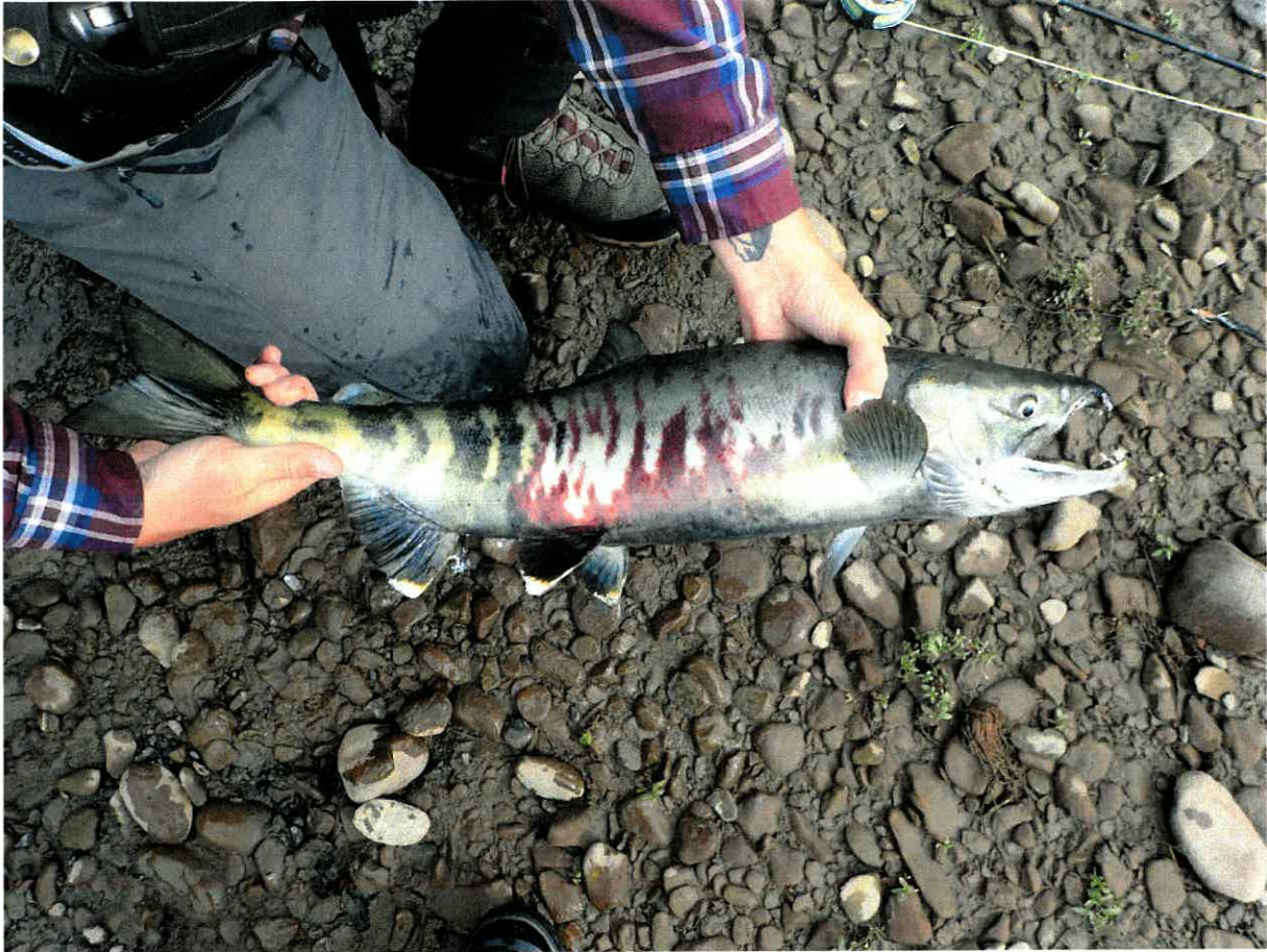
Male chum salmon