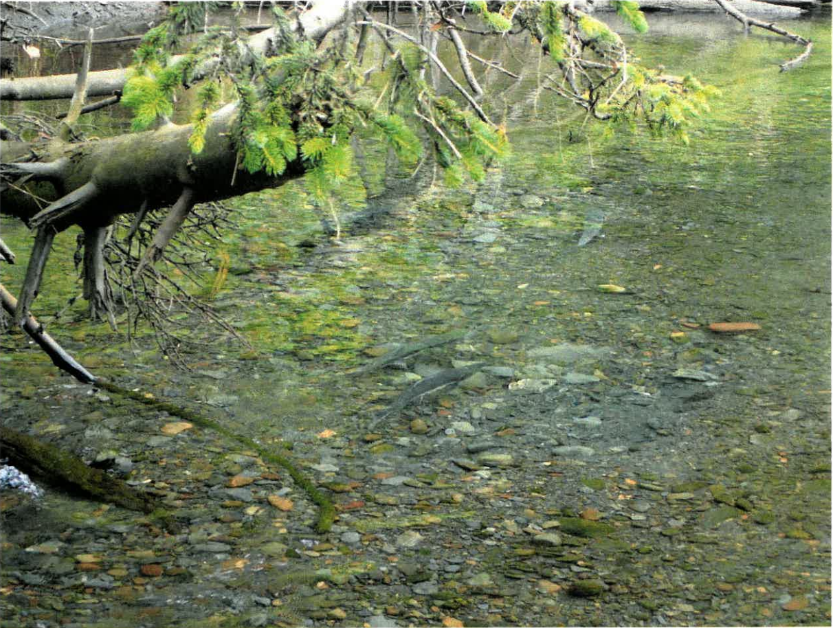
Pink salmon spawning in the foreground, chum salmon spawning upstream of them.