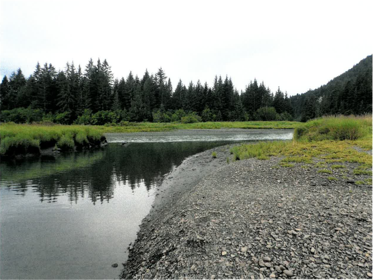
View of the mouth