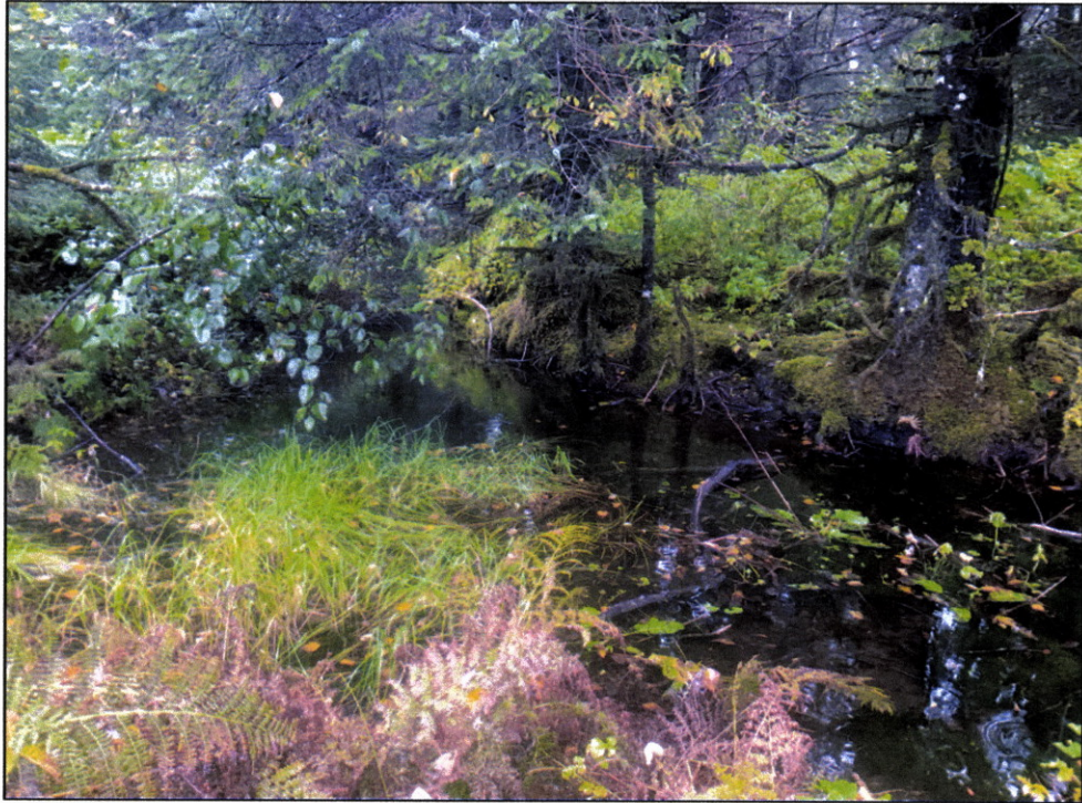
Figure 2.—Ditched channel at waypoint 1338.