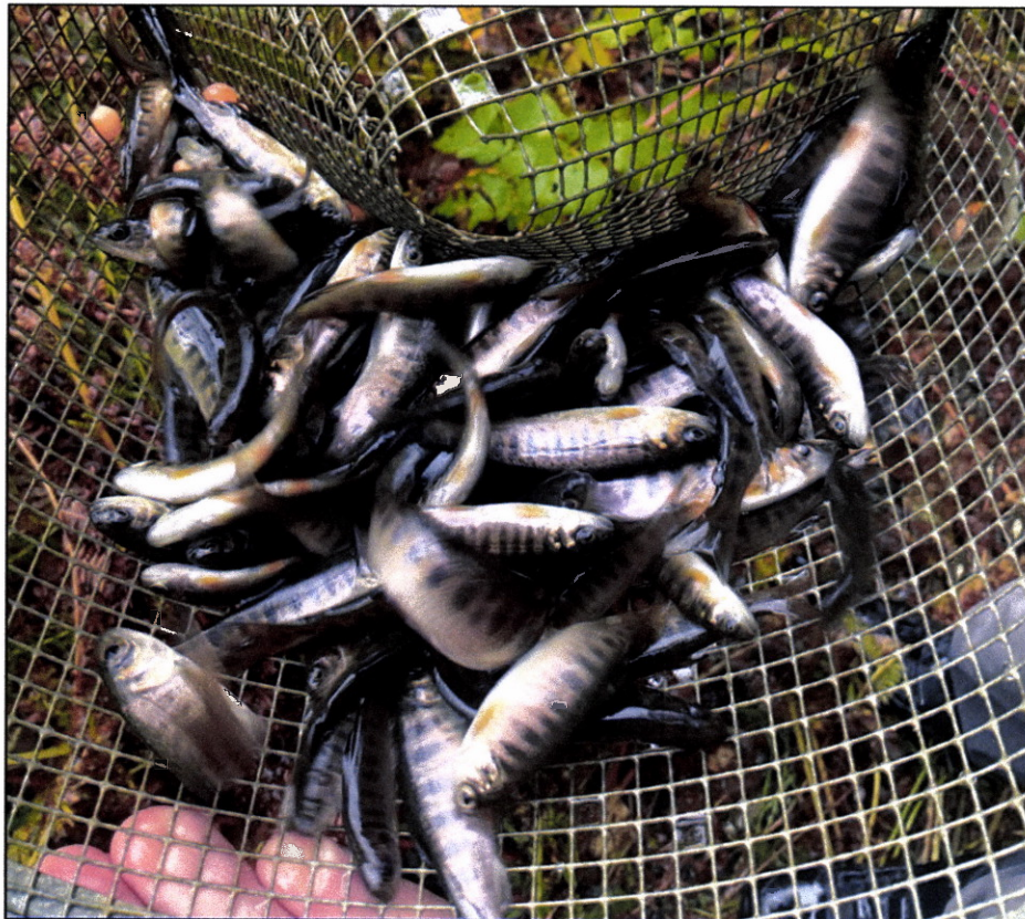
Figure 1.--Juvenile coho salmon and cutthroat trout captured at waypoint 1338.