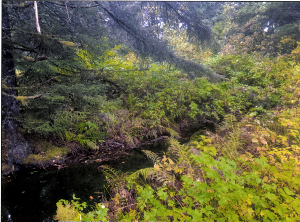
Figure 3.—Ditched channel at waypoint 1338.