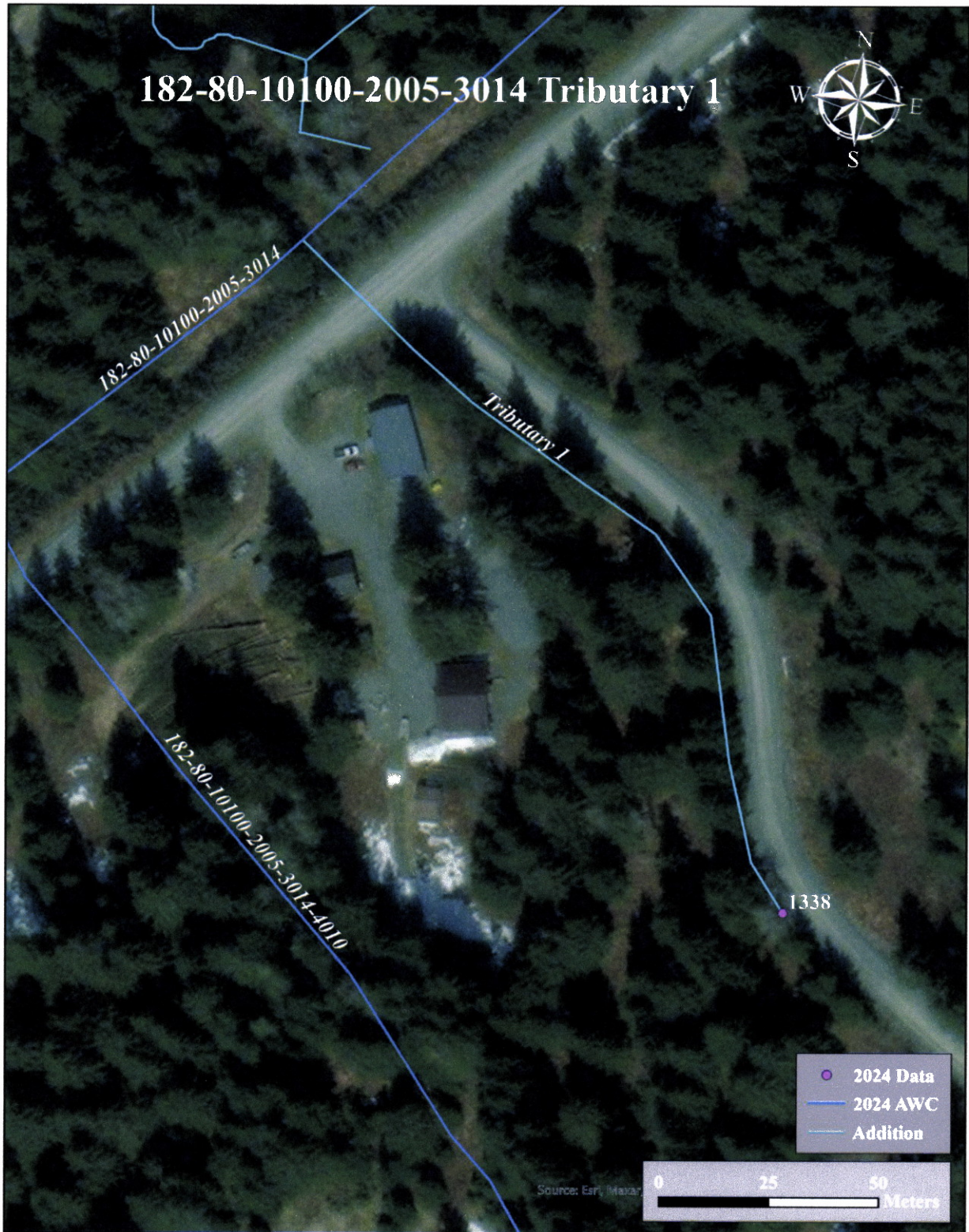
Figure 4.—182-80-10100-2005-3014 tributary 1 addition map.