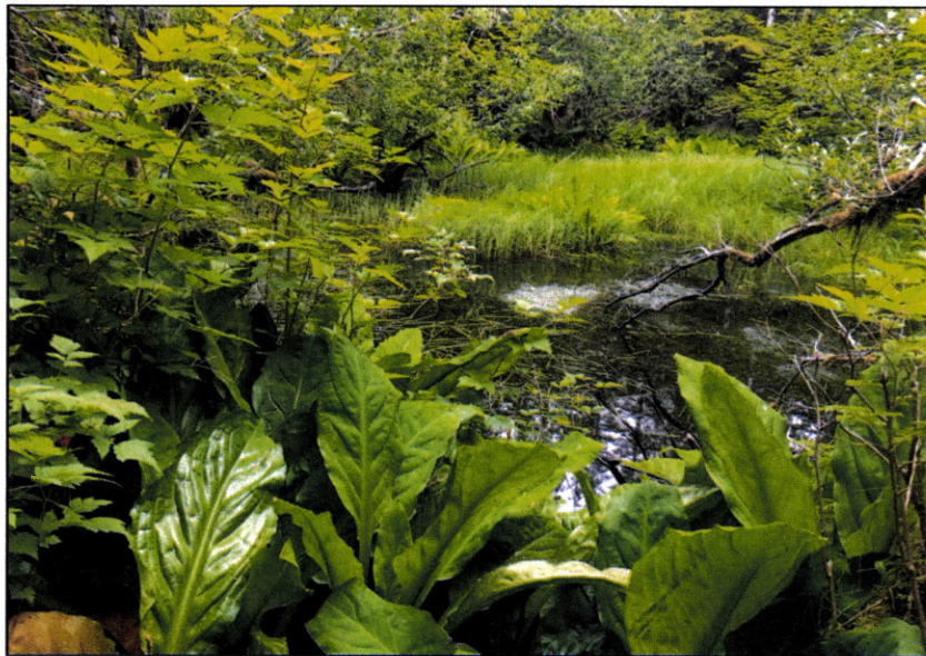
Figure 3.—Ponded water at waypoint 731.