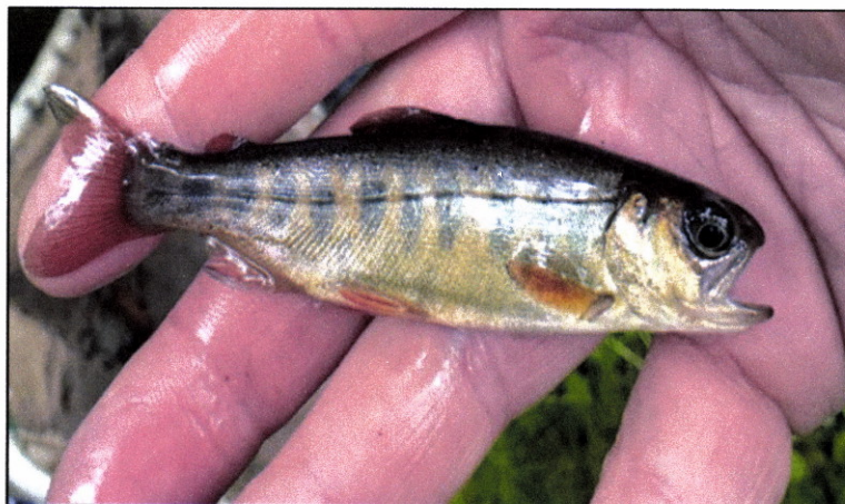
Figure 1.—Coho salmon caught at waypoint 730.