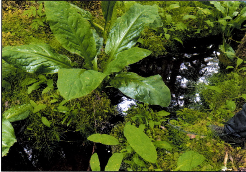
Figure 2.—Stream channel at waypoint 730.