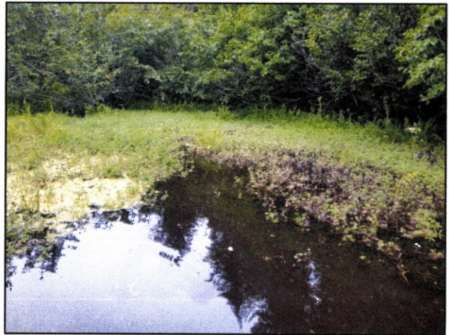
Figure 3.— Poned water at waypoint 822.