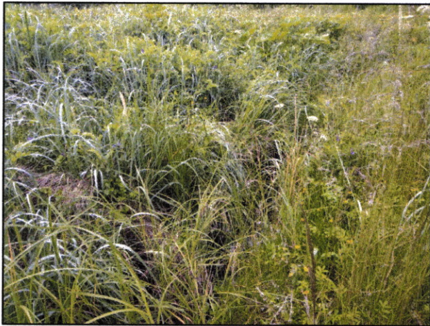
Figure 2.— Channel at waypoint 821.