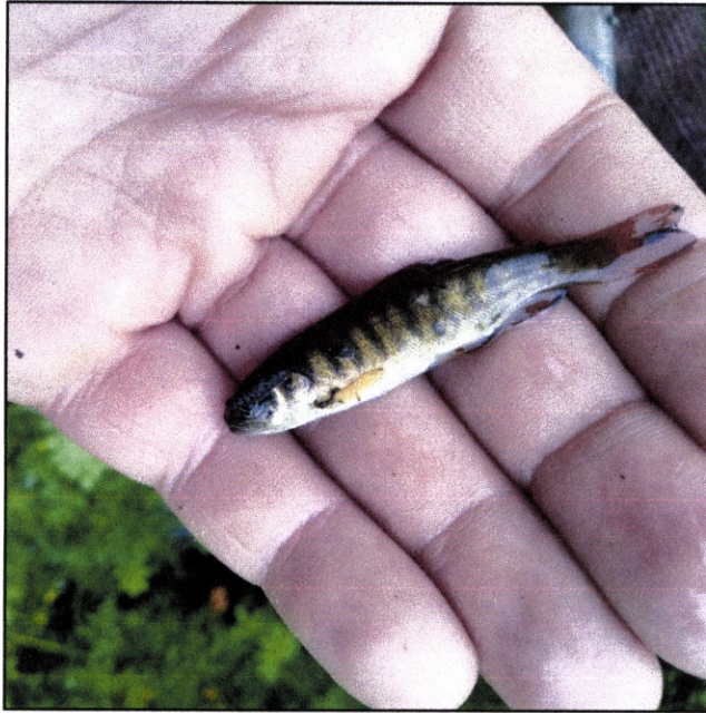
Figure 1.—Juvenile coho salmon caught at waypoint 821.