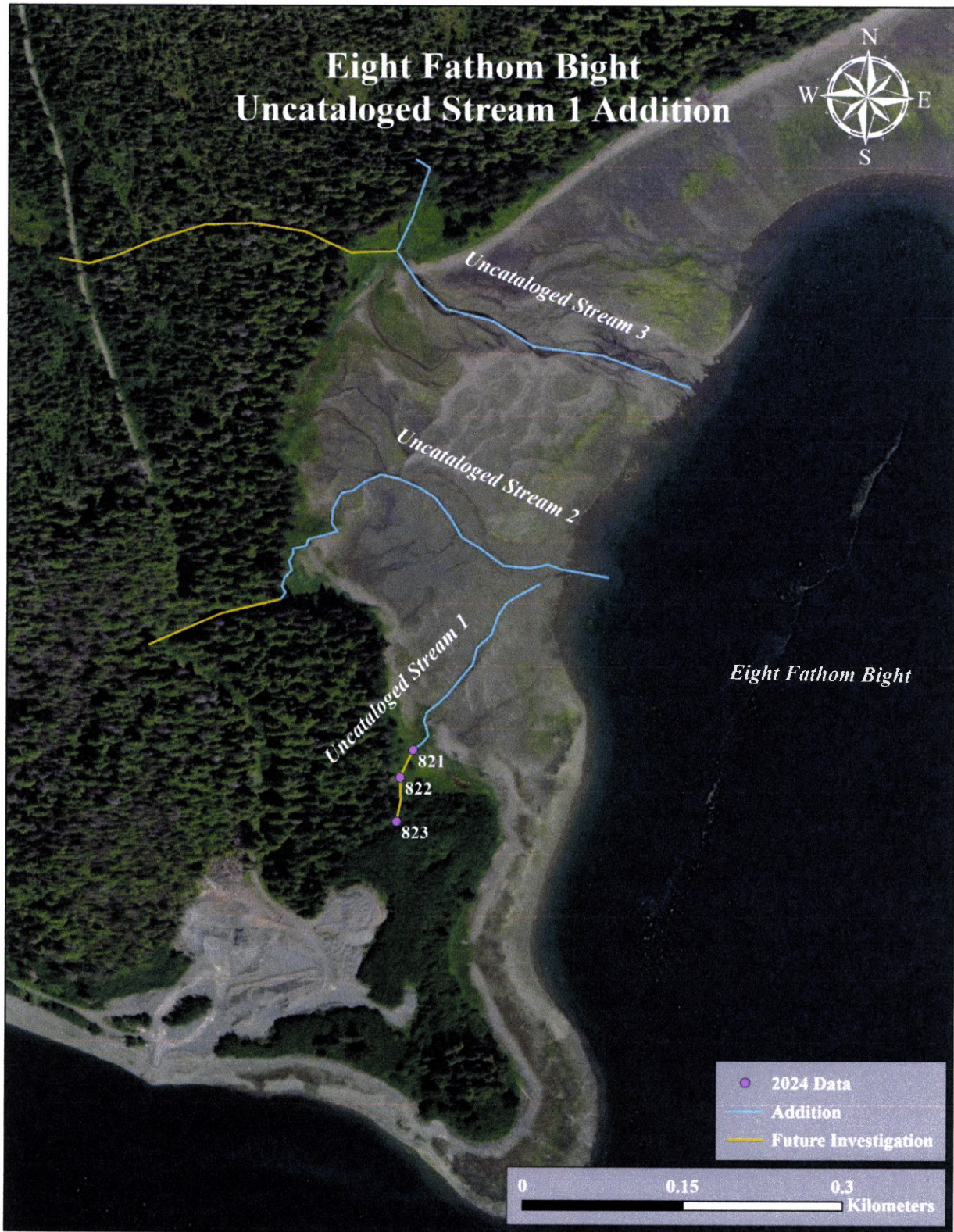
Figure 4.—Eight Fathom Bight Uncataloged Stream 1 Addition map.