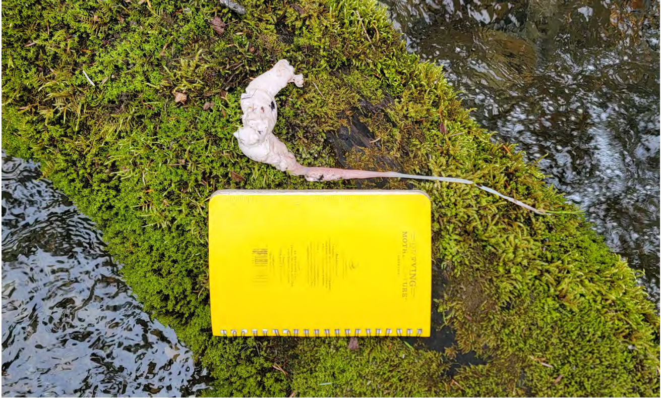
Figure 1.- Fresh milt sac on streamside log, presumably from an otter-predated steelhead. Notebook is 17.2cm for scale.