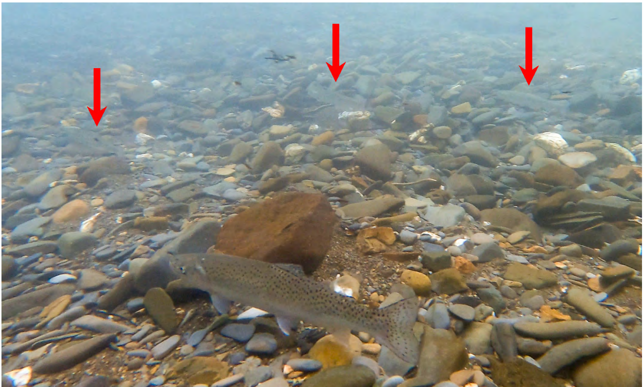
Figure 2.- Four rainbow trout at waypoint 4 - larger fish in foreground is ~30-35cm, others (red arrows) ~15-20cm.