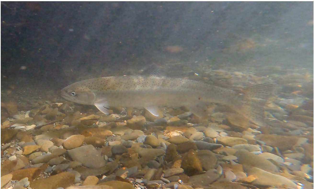
Figure 4.- Adult steelhead at waypoint 5.