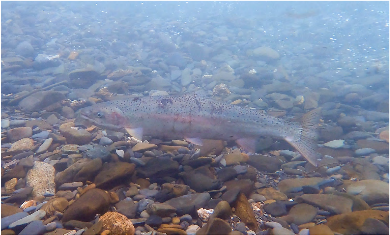
Figure 3.- Adult steelhead at waypoint 4.