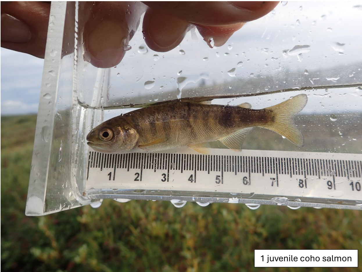
1 juvenile coho salmon